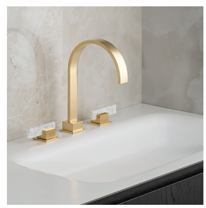
Sky White Carrara collection, shown in Matt Soft Gold