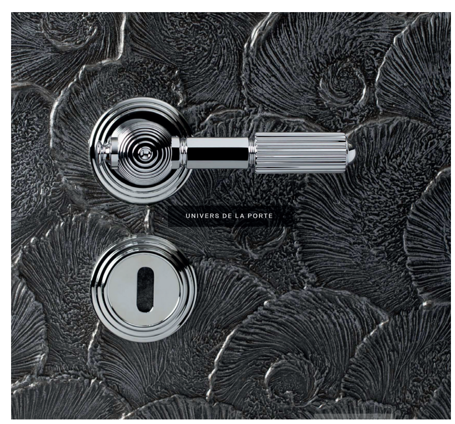
Dehmin collection, design Tristan Auer, shown in Polished Chrome