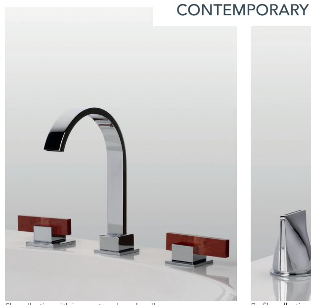
Sky collection with jasper stone lever handles