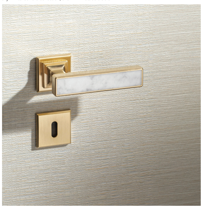
Square White Carrara door handle, shown in Matt Soft Gold