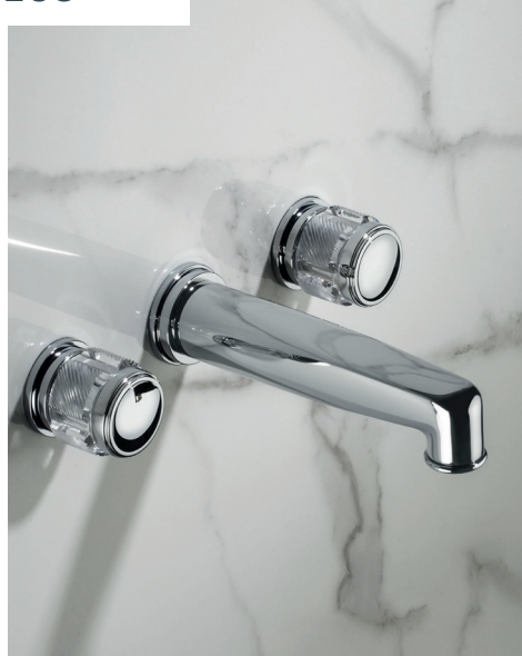
Wall mounted Chester Luxe collection