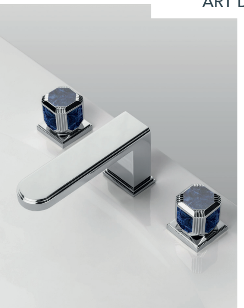
Coco collection in sodalite stone