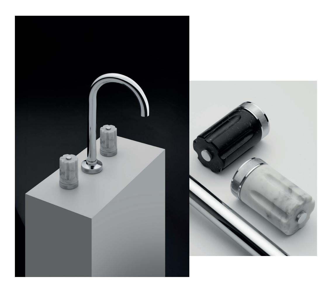
WIL. L, the new contemporary collection by Serdaneli focuses on a minimalist aesthetic and details highlighting the brand's unique craftsmanship.