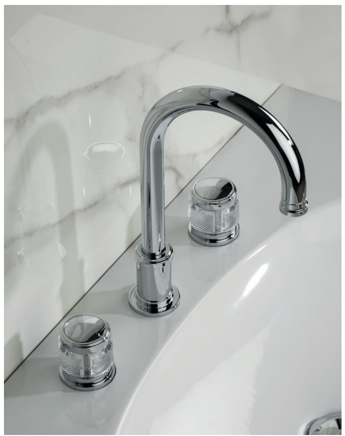
Collection Chester Luxe