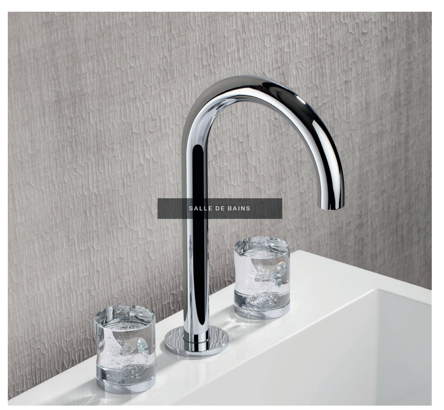
Céleste silver collection, shown in Polished Chrome