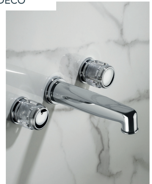
Wall mounted Chester Luxe collection