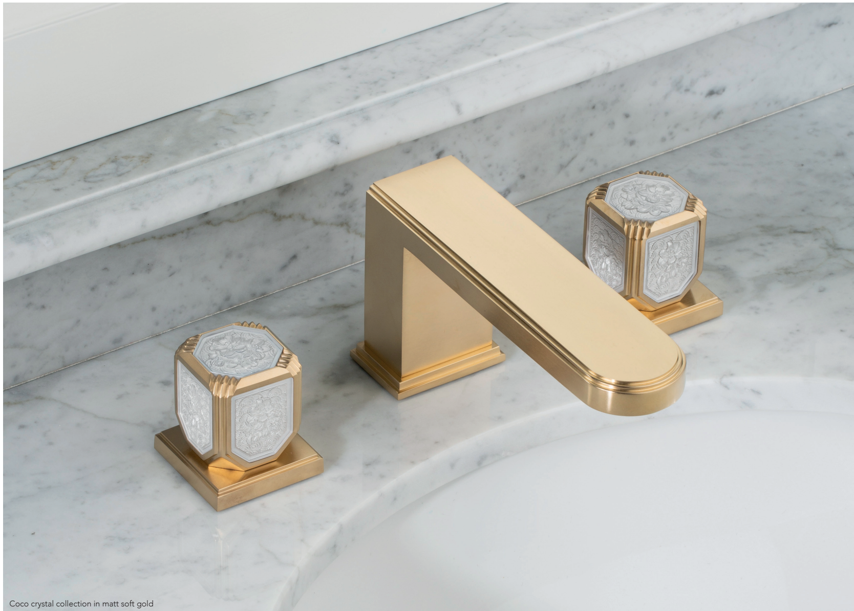
Coco crystal collection in matt soft gold