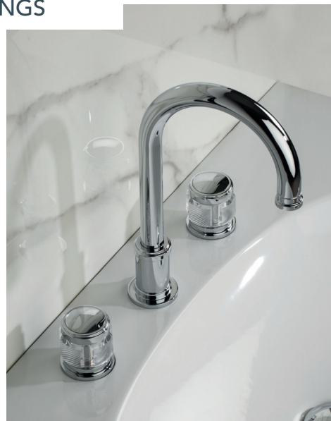
Chester Luxe collection