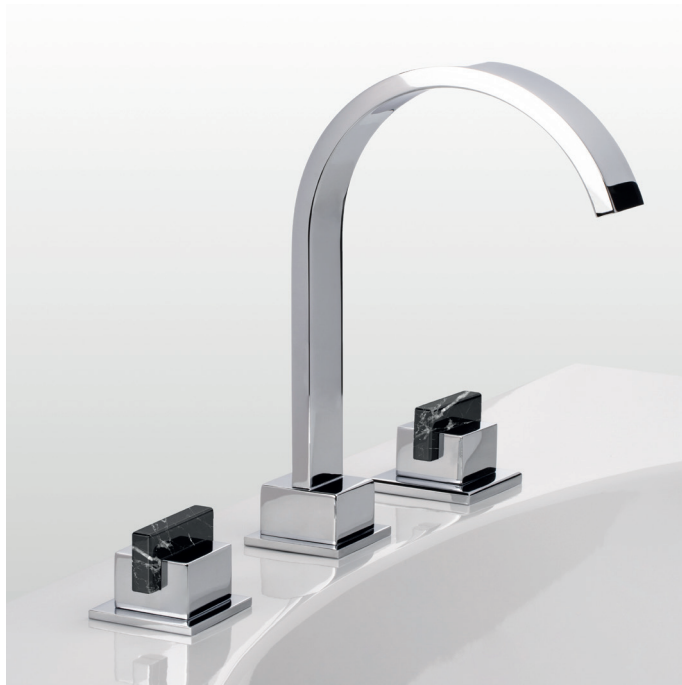
Sky collection in black portoro