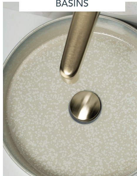
Small Taïga basin, in Song Perle enamel