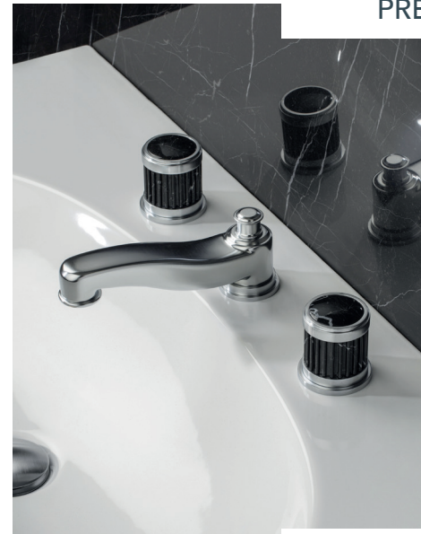
Trianon collection in black portoro