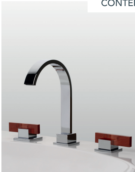
Sky collection with jasper stone lever handles