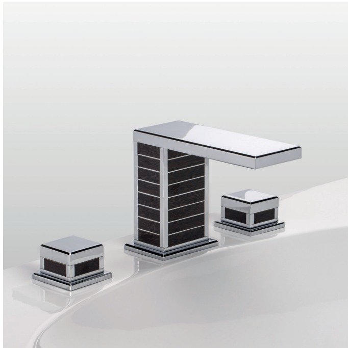
Square collection in wenge