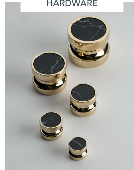
Néo buttons in black portoro