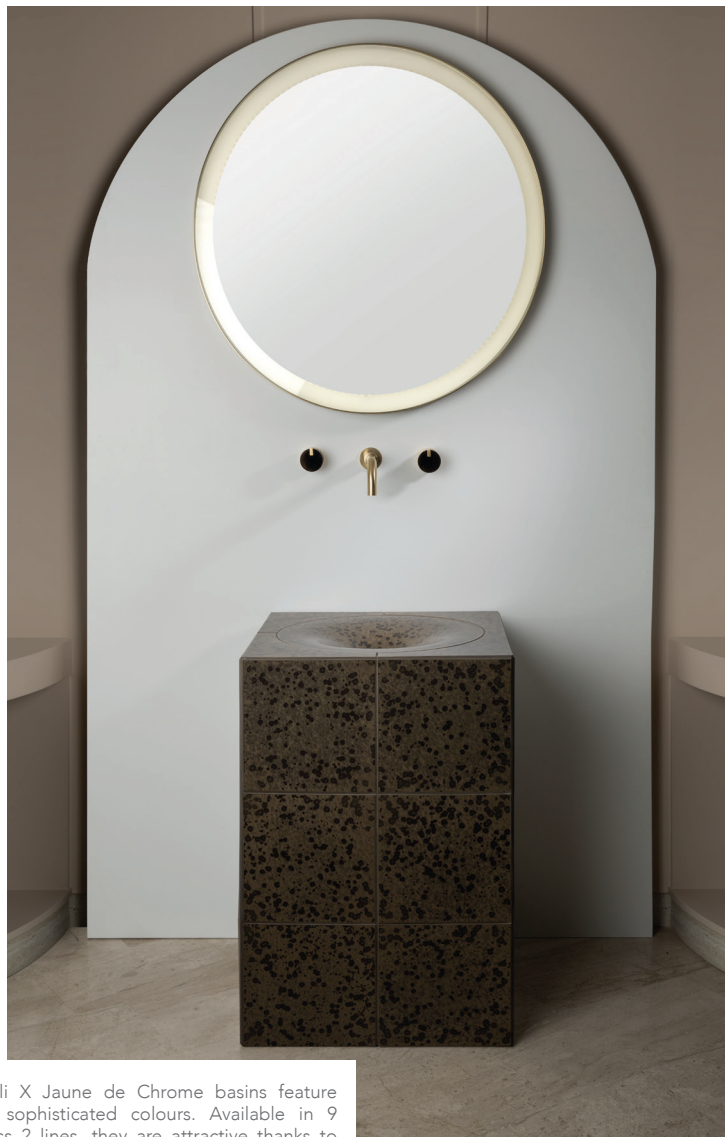
The Serdaneli X Jaune de Chrome basins feature intense and sophisticated colours. Available in 9 designs across 2 lines, they are attractive thanks to their originality and their subtle, mineral appearance.

Among its latest products, Serdaneli has also partnered with Jaune de Chrome - renowned for its high-temperature enameling technique - to create a collection of 9 porcelain basins with unique designs.